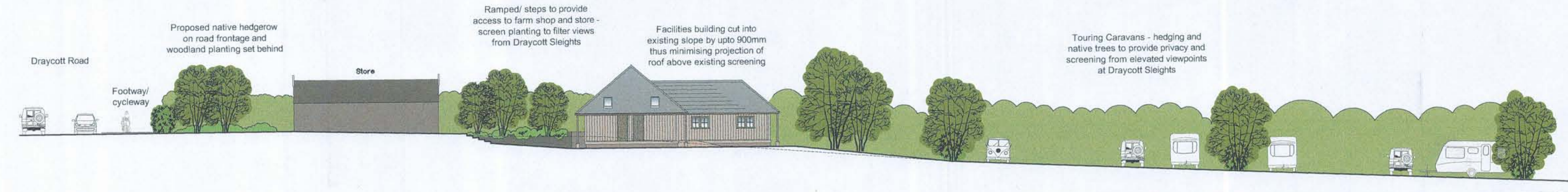
Section D-D: Facilities Block and Touring Pitches